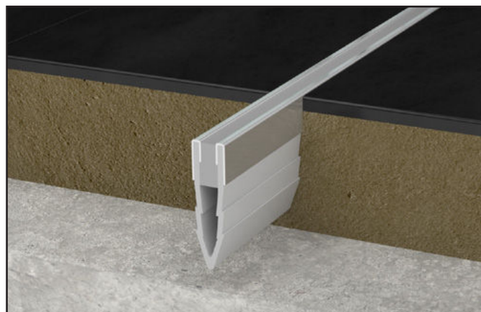
JF 700/S gris / JF 700/S grey