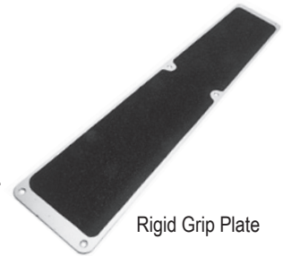
Rigid Grip Plate