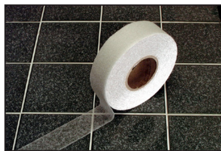
Transparent on tiles